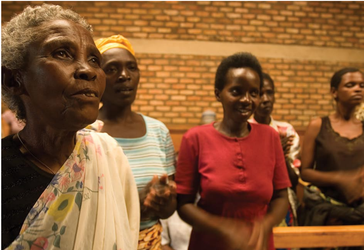
Women from the ABASA association work together in a modest location outside of Butare, sewing school uniforms for local students and harvesting bee honey as a source of revenue for their community. ABASA is a non-profit organization that promotes leadership and professional development for women survivors, all of whom were victims of rape during the genocide.

ProFemmes is an umbrella organization for the advancement of women in Rwandan society, through personal and professional development. The organization has tripled in size and reach since 1992, with approximately thirty staff members working in their regional office in Kigali. As many as forty-eight initiatives fall under their advocacy, focusing on peace building, capacity building and human rights projects. The organization is outspoken in women's rights issues, including advising the government on issues of women's political participation and gender inequality. Since the genocide, ProFemmes was pushing the International Criminal Tribunal for Rwanda and the United Nations to provide free ARVs (anti-retroviral drugs) for women survivors. Member organizations of ProFemmes include Women for Women, AVEGA and Rwanda Women's Network.