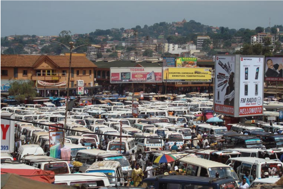
The central taxi hub in Kampala, Uganda, embodies the chaotic hustle and bustle of the capital city.