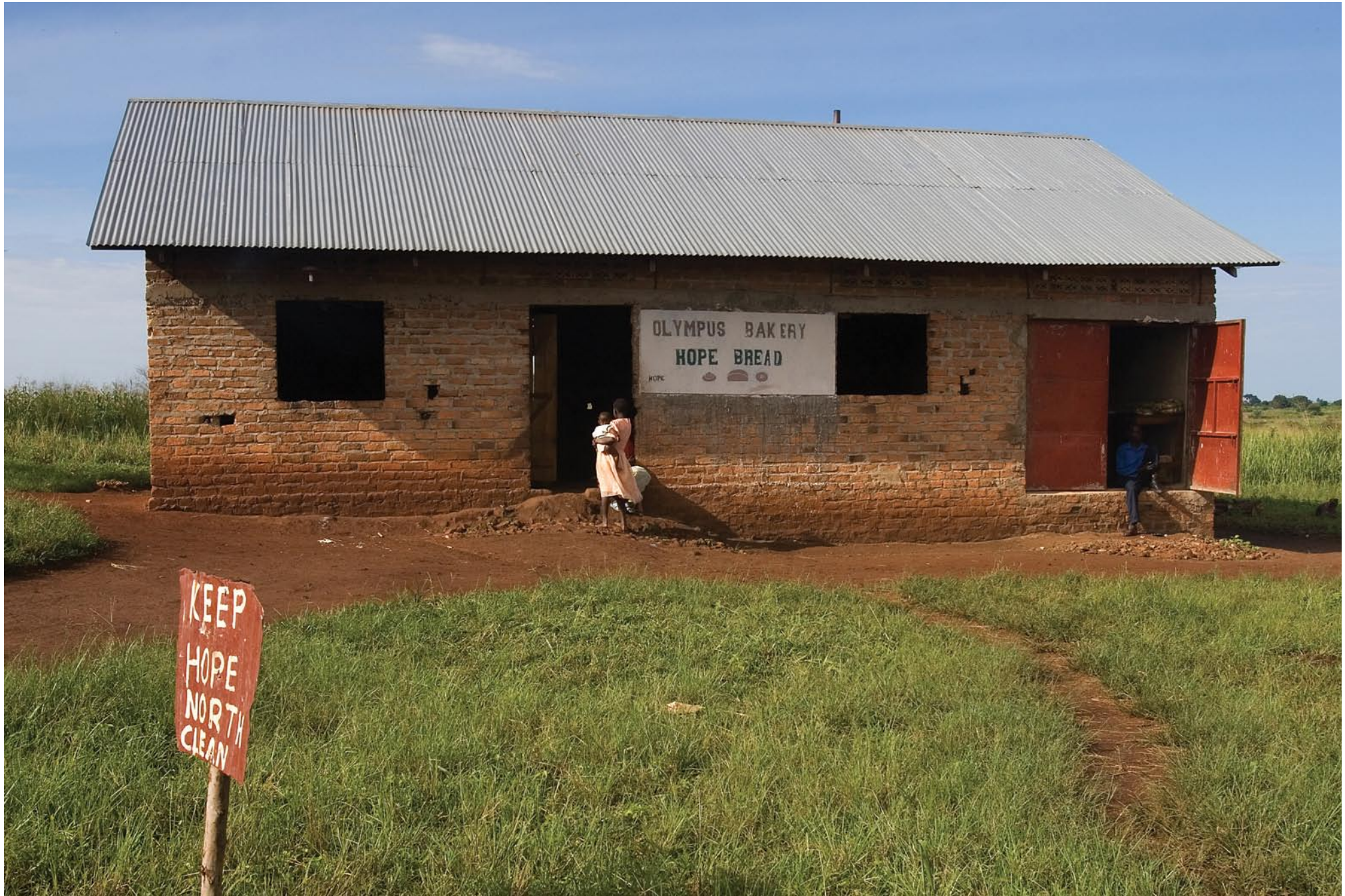
Agriculture is one of the fastest growing sectors in rural Uganda. At Hope North Vocational School in northern Uganda, students dedicate time and energy to their on-site bakery. Rumor has it that the best bread in town comes from the Hope North bakery.