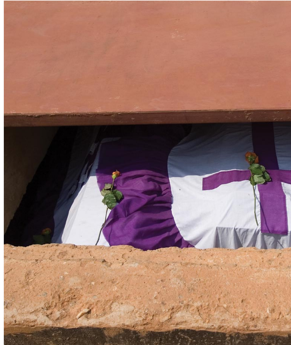
Mass graves at the Kigali Memorial Center contain over 200,000 victims. In 2007, bodies are still

Our journey concluded in Uganda where we completed our final round of investigations. Keeping with the rhythm of the trip, each new conversation deepened our understanding of the complex realities and expanded our capacity to witness. By no means do we assume that our findings reflect an understanding of the total landscape.