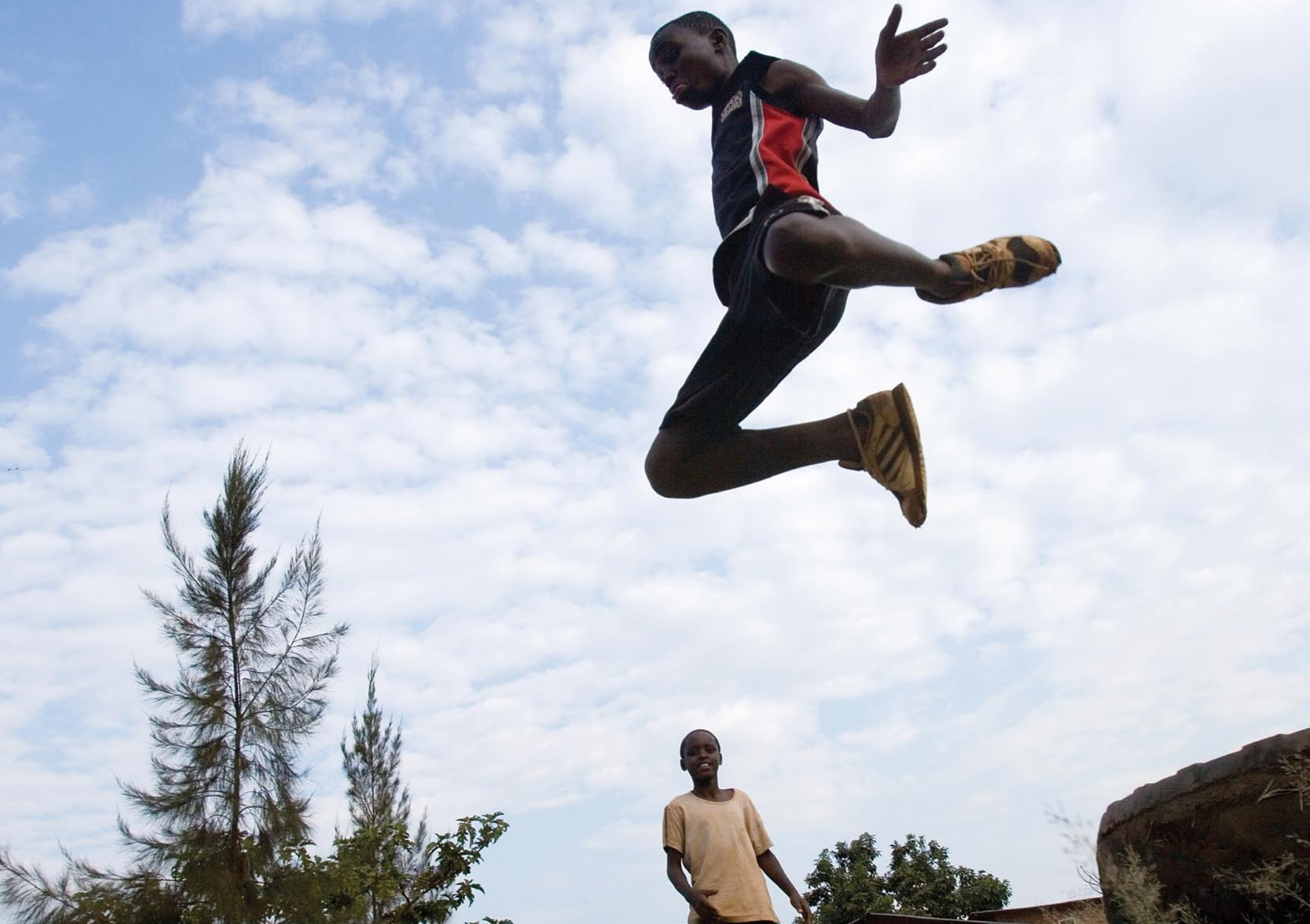
Orphans are the most innocent victims of all. Many have no income, making going to school absolutely out of the question. Here, young boys at the ASBL Gissimba Orphanage in Kigali enjoy a carefree moment using an old tire as a launching pad for extreme air.