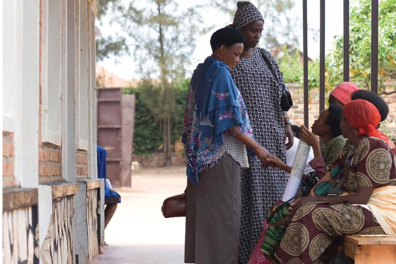
Almost all women were victims of rape during the genocide. Many women travel hundreds of miles to receive medical attention at the AVEGA site in Kigali, the capital city of Rwanda.

Going to scale and finding innovative ways to disseminate educational programs to the different regions will be key to the success of this collaboration. Long distance travel and costly administrative expenses diminish the possibility of meeting the needs of rural communities.