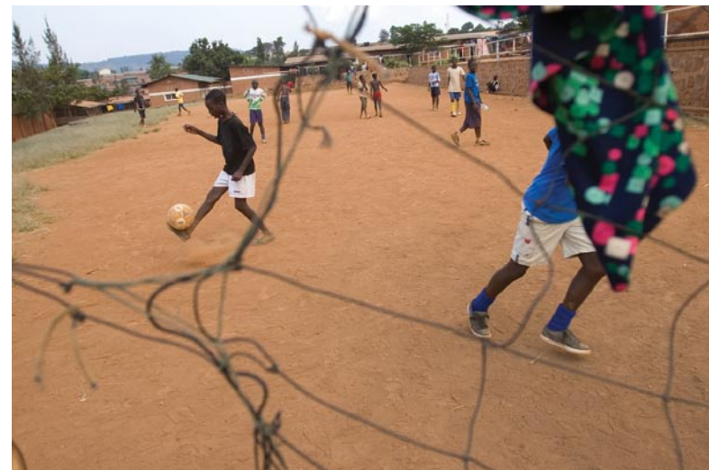
TOP: Children at the ASBL Gissimba Orphanage in Kigali. CENTER: Most Rwandans transport water from community watering holes to their homes. BOTTOM: Boys at the ASBL Orphanage play soccer for hours on end on their make-shift dirt court.