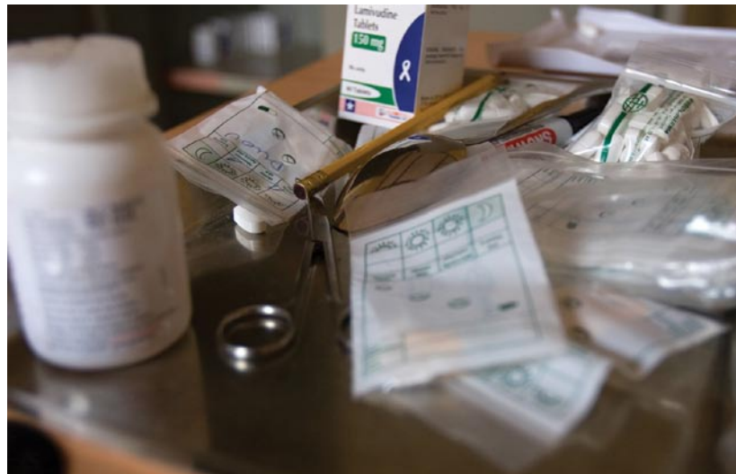
Lack of medical supplies for adequate treatment is a constant threat to the medical health staff and patients.