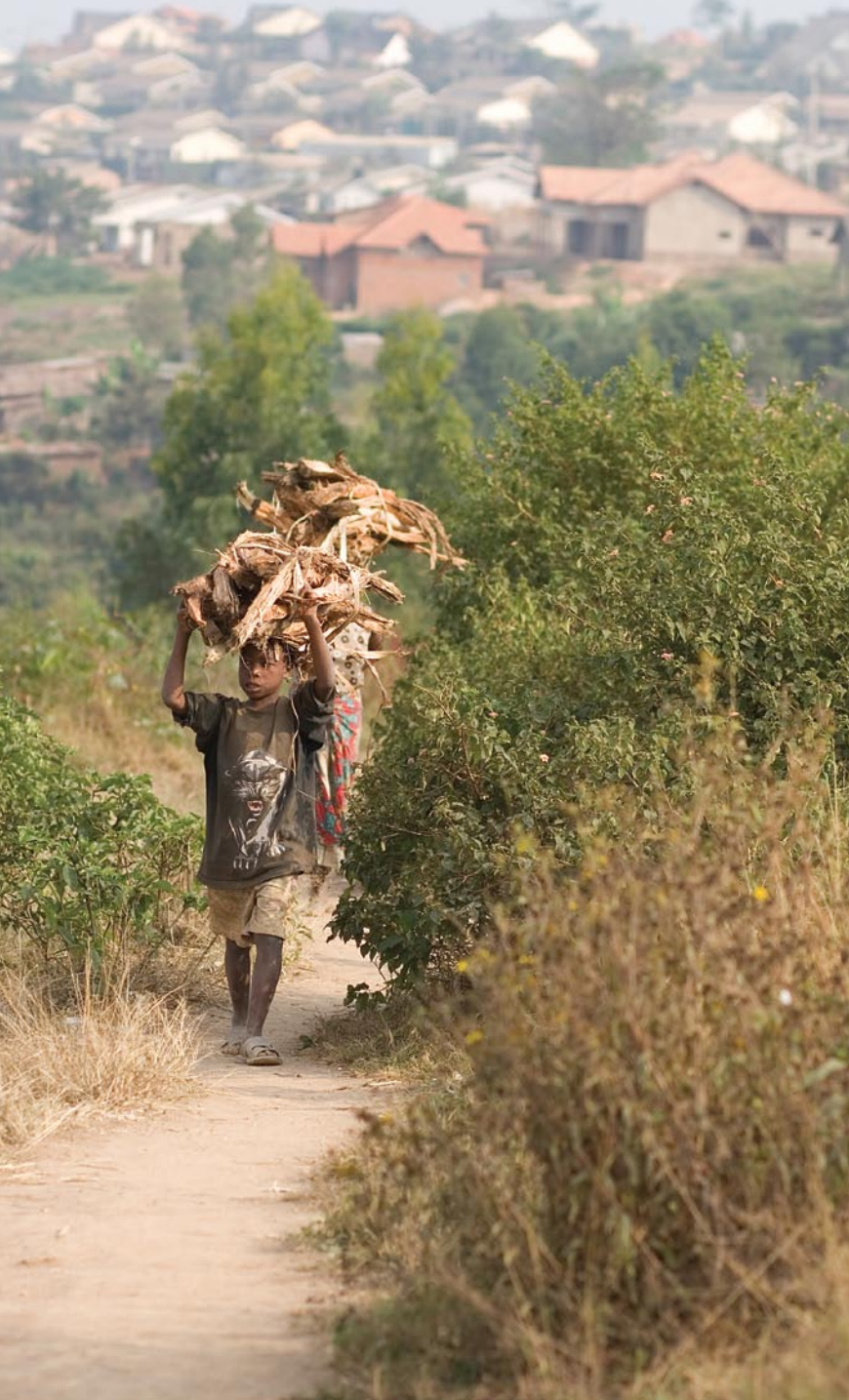
Children of all ages participate in a monthly community day as a hands-on commitment to beautify Rwanda.