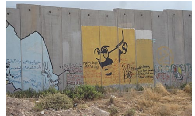
The security wall outside of Ramallah, Palestinian Territory, 2007.