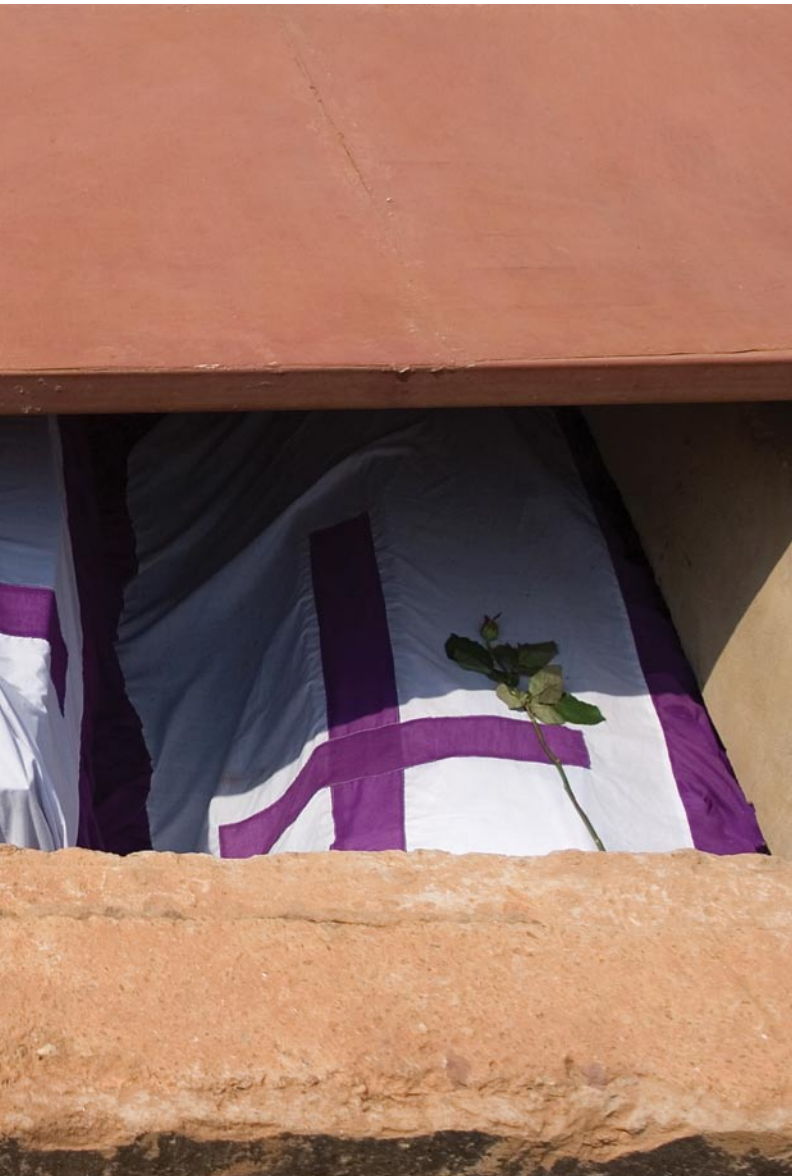
being exhumed and given proper burial.

The central outcomes of mindful awareness are too valuable to remain hidden. Imagine for example, if Israelis and Palestinians could revisit their respective national identities using the lens of mindful awareness. Suppose an inquiry about the nature and source of conflict is examined not solely based on the interpretation of historical underpinnings and past harms, but based on fresh understanding and insight. Where the role of personal and social responsibility and the value of diversity is investigated as a means for peaceful coexistence. Could this foster a medium for individual and societal change?