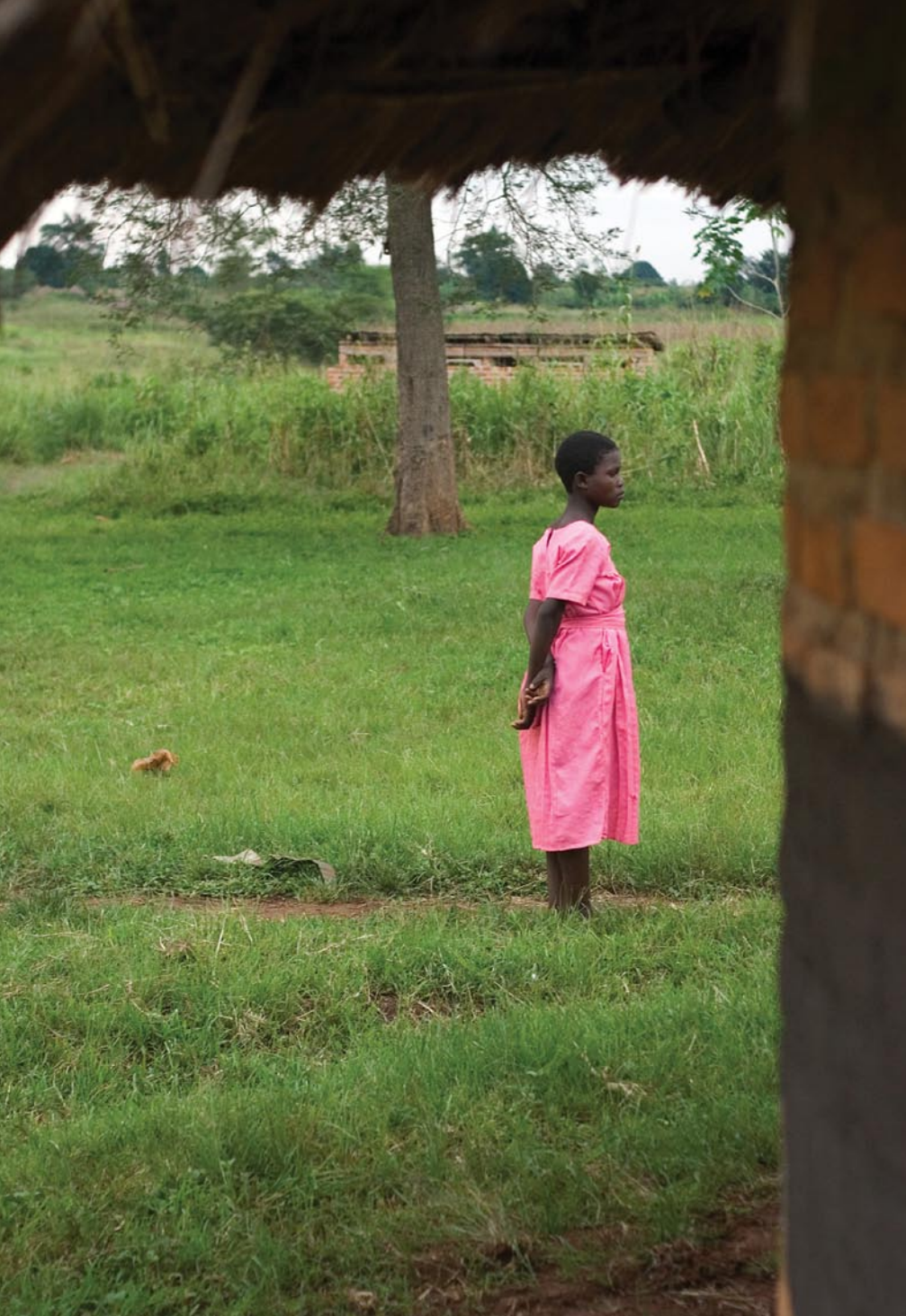
A young girl who attends the secondary school at Hope North enjoys a quiet moment before helping to prepare the evening meal.

Hope North is continually challenged with a long list of maintenance and infrastructure improvements. That said, the administration continues to foster a positive living and learning environment that promotes the common humanity that they share together.